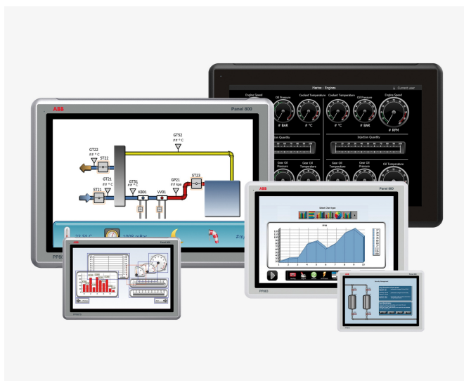
ABB Ability™ System 800xA® hardware selector

The Panel 800 family comprises user-friendly, intuitive, and ergonomic operator panels that combine slim, space-saving dimensions with a comprehensive range of advanced functions. Designed to make process automation easy, all panels are equipped with touchscreen operation with advanced functionality for process and equipment control.