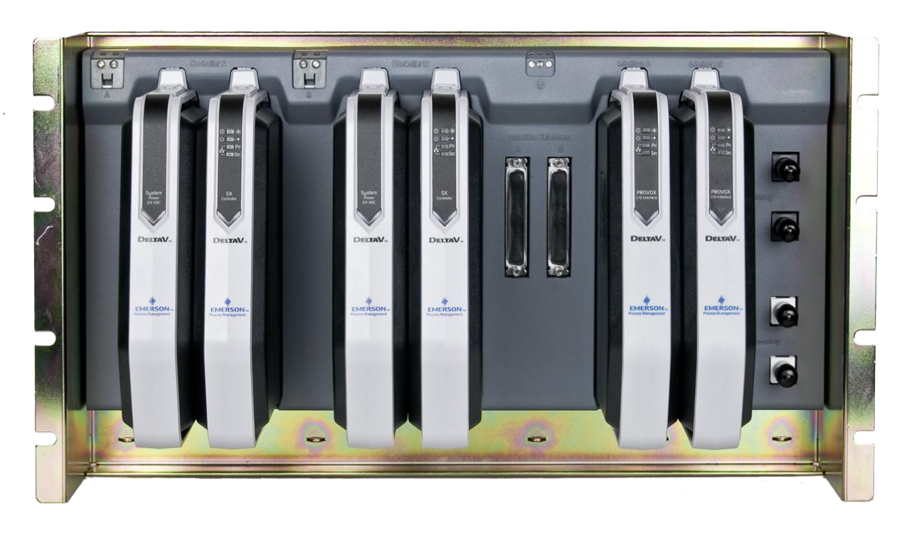
The S-Series DeltaV Controller Interface for PROVOX I/O.